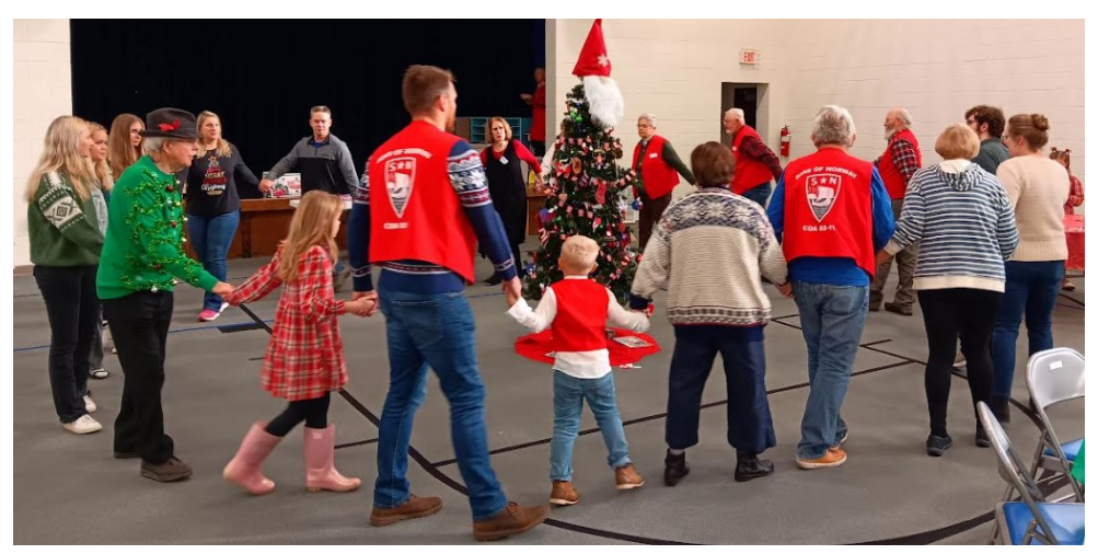
Above: Lodge members hold hands and dance in a circle around the Jul Tree while singing traditional Christmas carols